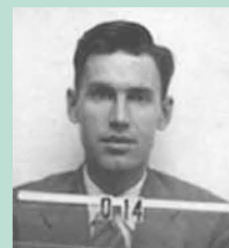
Robert Christy's wartime Los Alamos security badge

1935 a : Robert Christy (below) receives a BA and the Governor General's Gold Medal, going on to a PhD with J. Robert Oppenheimer at Berkeley, and a significant role in the Manhattan Project. The "Christy Pit" is the design of the plutonium core at the heart of an implosion bomb).