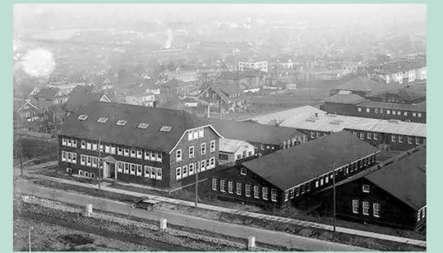
UBC Fairview Campus

1925: UBC moves to the Point Grey Campus; Physics moves into the Science Building (now Block D of the Chemistry Building, the oldest building on UBC campus).