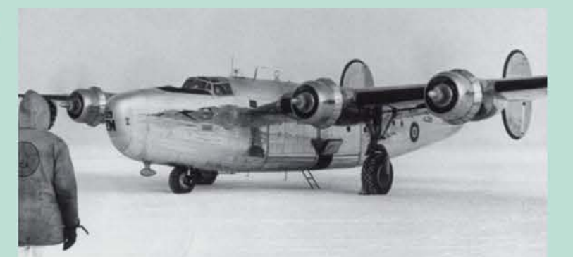
Liberator at Montréal Airport en route across the North Atlantic in winter