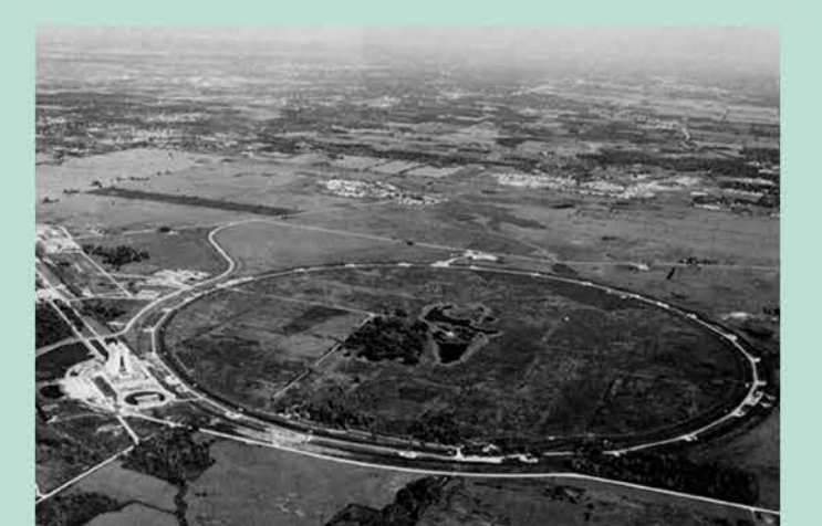
The main synchrotron ring at Fermilab, Illinois.