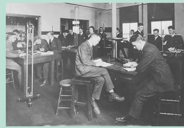
Physics laboratory at Fairview, 1919

1915: UBC opens in the "Fairview Shacks" at 10th and Laurel. Four physics courses offered in the Faculty of Arts (later Arts and Science).